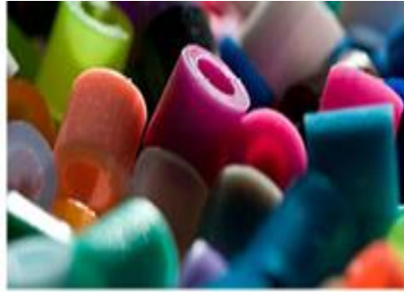
Plastic is _____.