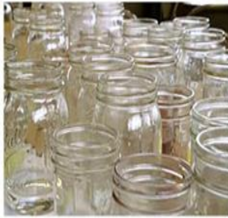
These jars are made from glass. Glass is _____.