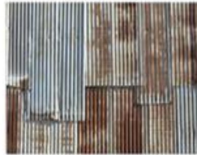
Metal _____ _____ _____