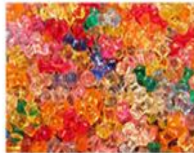
Plastic _____ _____ _____