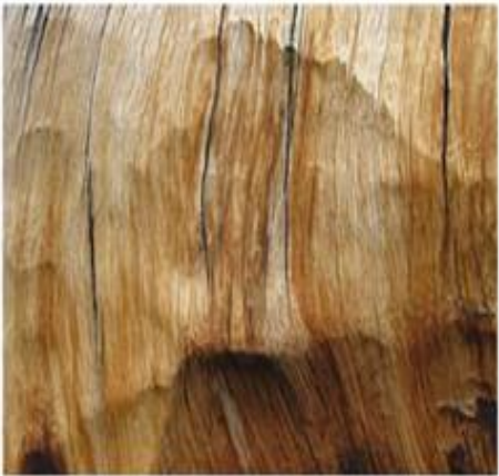
Wood is _____.