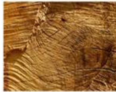
Wood _____ _____ _____