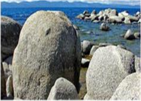
Rock is _____.